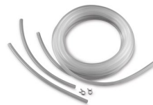
Silicon hose extension set for 2-stroke engines