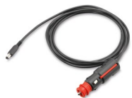
Connection cable (2 m) for BEA 060 to cigarette lighter socket