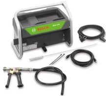
Diesel extension set