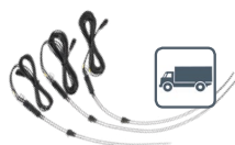
Temperature measurement probes