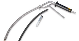
Gasoline passenger car exhaust gas sampling probe (part load up to 500 °C)