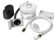
NO extension set