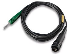
TN/TD rotational speed line L = 4 m