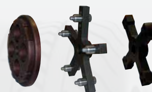
ART 40 - truck flange centring kit