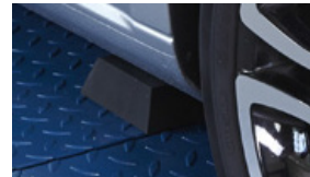
Truncated pyramid pad