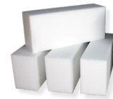
Polymer pads 100 x 150 x 340 mm