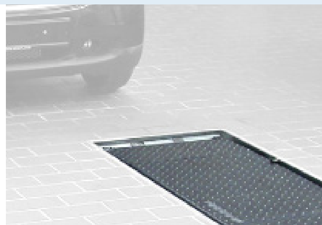
In-ground or above ground installation