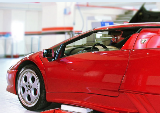
Very flat construction: Perfect for sports cars

JUMBO LIFT NT 3200, 3500, 4000: WE OFFER THE RIGHT CAPACITY FOR ANY WORKSHOP