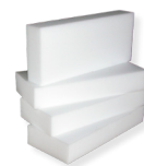
Polymer pads 50 x 150 x 340 mm